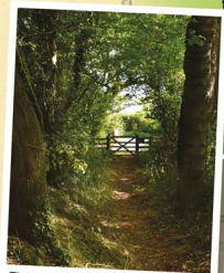
The ancient ridgeway path. The ancient ridgeway path.

Pennorth phone box has been restored by the local community and is now used as a library. If you continue along the main road for a few metres you cross the old railway bridge. It was built to carry the road over the Brecon & Merthyr Railway which opened in 1863 and closed in 1962. There was never a station in Pennorth - villagers had to walk to Talyllyn if they wanted to catch the train. Beyond the bridge is the Tabernacle chapel. Built in 1841 and rebuilt in 1893, it is now the only chapel still in use around Llangors Lake.