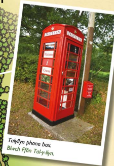
Talyllyn phone box. Blwch Ffon Talyllyn.