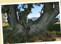
Gnarled old trees line the ridgeway path. Gnarled old trees line the ridgeway path.

Talyllyn is a relatively new village - most of the houses were built after the opening of the railway station in 1863. The station was a junction with lines from Newport, Hereford and Llanidloes converging here before heading into Brecon. It may seem like a sleepy backwater today, but a century and a half ago this was a well-connected transport hub.